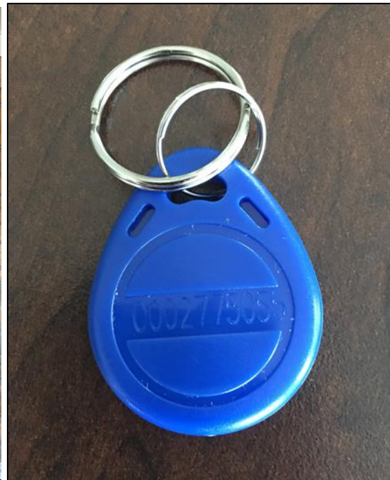
FOB Registered to each home